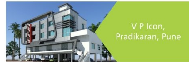
V P Icon, Pradikaran, Pune