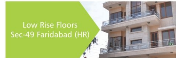
Low Rise Floors Sec-49 Faridabad (HR)