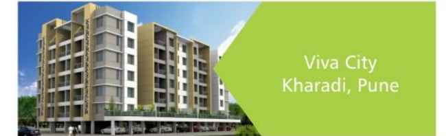
Viva City Kharadi, Pune