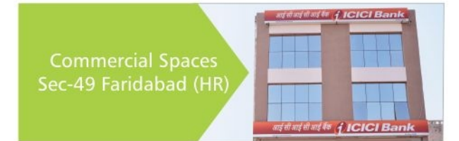
Commercial Spaces Sec-49 Faridabad (HR)