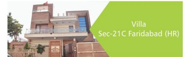
Villa Sec-21C Faridabad (HR)